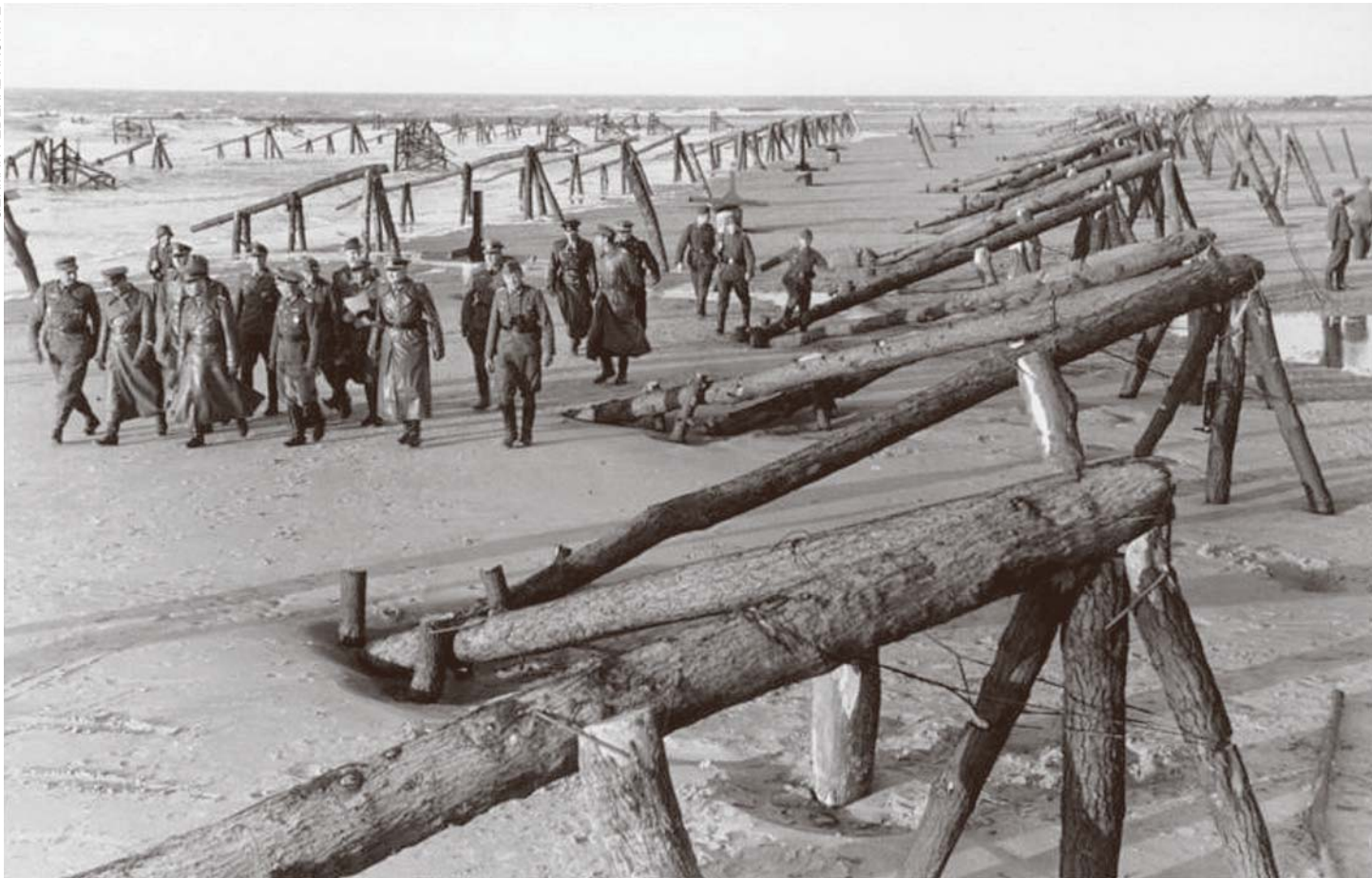
Figure 1. German Field Marshal Erwin Rommel (front row, third from left) on the French channel coast in April 1944, at low tide. He was inspecting some of the millions of obstacles he had ordered built between the low- and high-water lines on beaches where the Allied invasion force might land.

the Earth-covering waters into several large oceans. Newton, having assumed for simplicity that the sea responds instantaneously to the astronomical forces, essentially ignored all hydrodynamic effects—for example, the effect on the tide of the natural oscillation frequency of an ocean basin, something that Galileo had recognized.